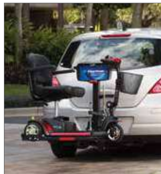
Multiple auto lift solutions for chair or scooter