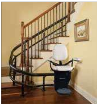
Curved and Straight Stair Lifts