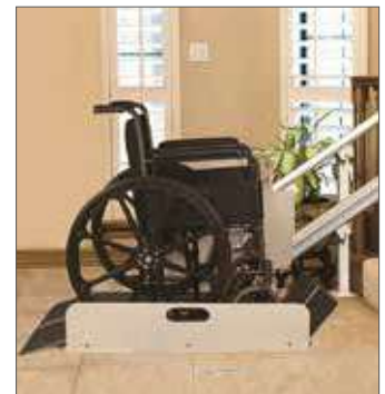
Incline Platform Lifts