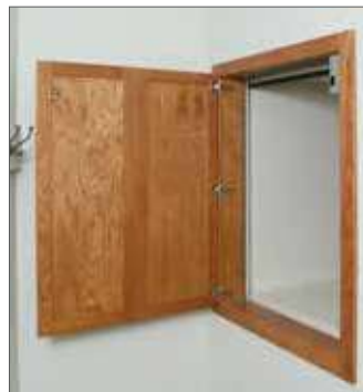
Dumbwaiters and Cargo Lifts